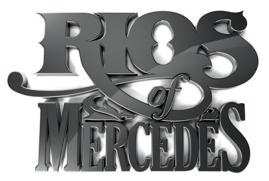
SINCE 1853 • HANDMADE IN TEXAS OFFICIAL BOOT OF THE NRHO